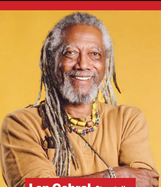
Len Cabral Storyteller